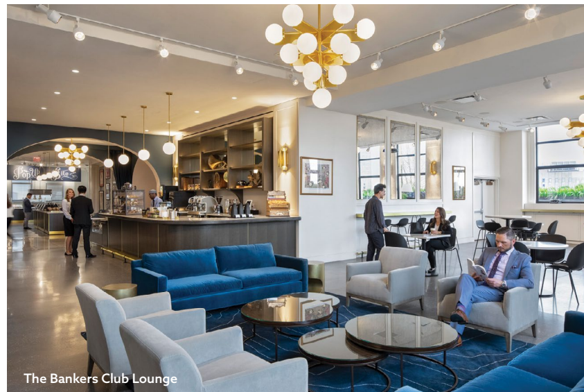
The Bankers Club Lounge